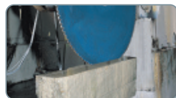
Single blades for marble