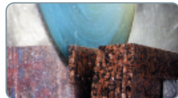
Single blades for granite